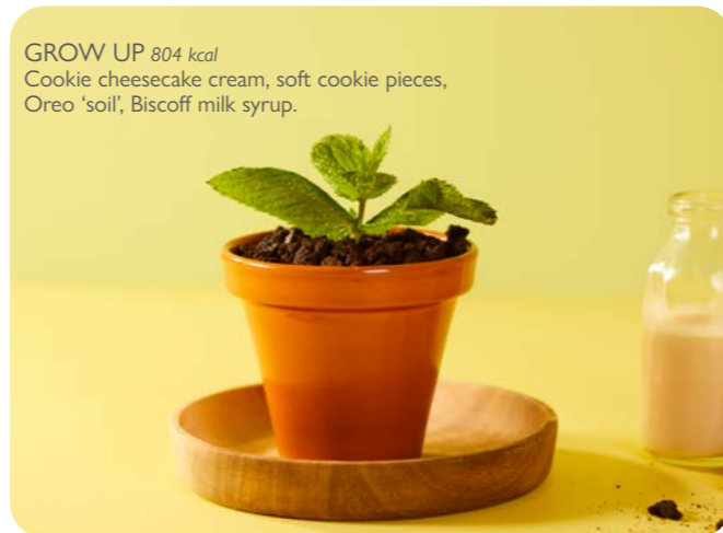
GROW UP 804 kcal Cookie cheesecake cream, soft cookie pieces, Oreo 'soil', Biscoff milk syrup.

WHITE CHOCOLATE BONBON 524 kcal Rich cheesecake encased in white chocolate, crushed meringue, fresh raspberries, raspberry sauce.