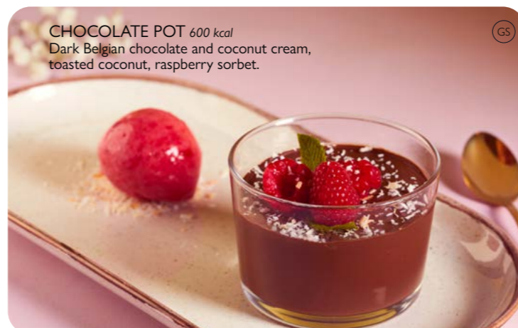
CHOCOLATE POT 600 kcal Dark Belgian chocolate and coconut cream, toasted coconut, raspberry sorbet.

STICKY TOFFEE PUDDING 623 kcal Classic spiced date and toffee pudding, rich toffee sauce, honeycomb.